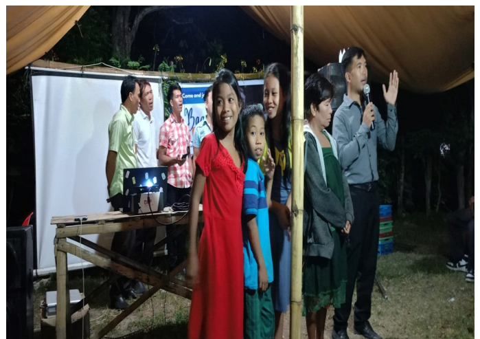
The speaker in Dao calling those who are willing to be baptized during the final night of the crusade.