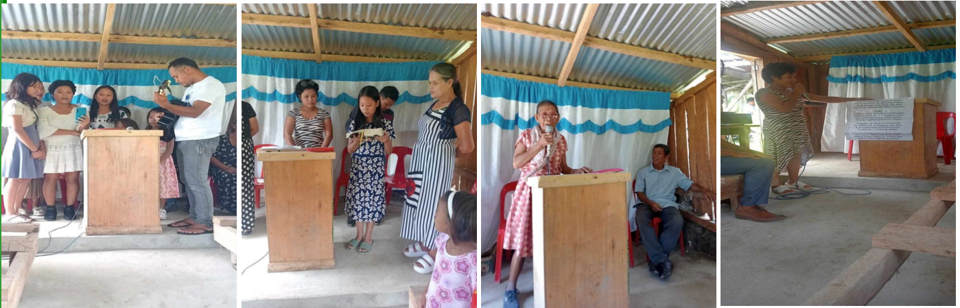
The brethren actively participating in the Sabbath worship at Dao Church together with the brethren from Talisay Church.