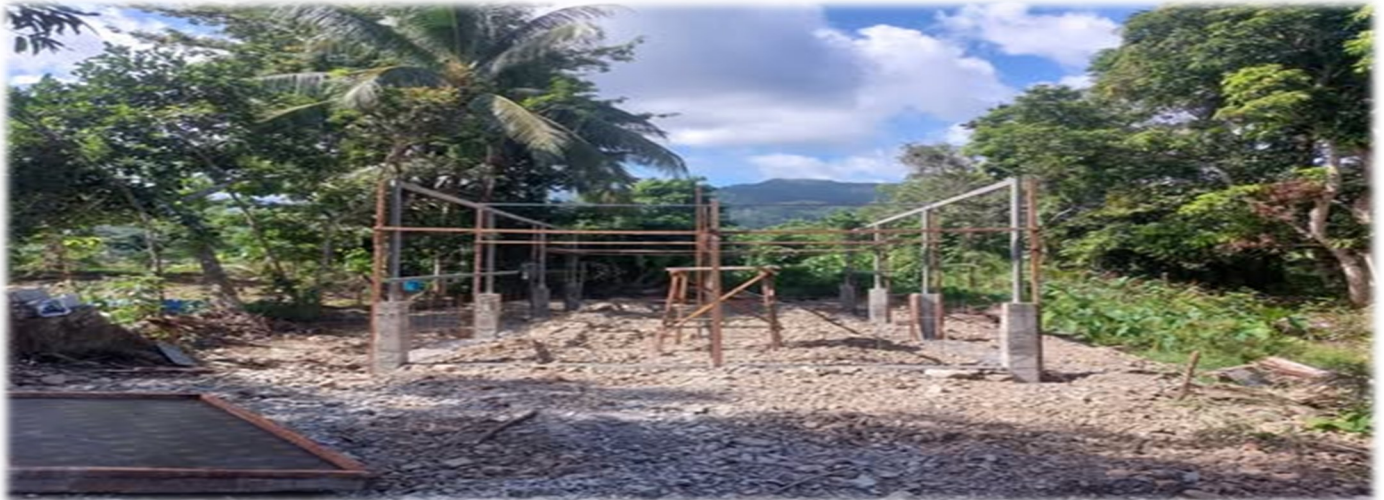
The current structure of the on-going church construction in Apis, Palawan as of December 15, 2024.

The church construction in Apis is progressing steadily. The foundation has already been completed, ensuring a strong and stable base for the structure.