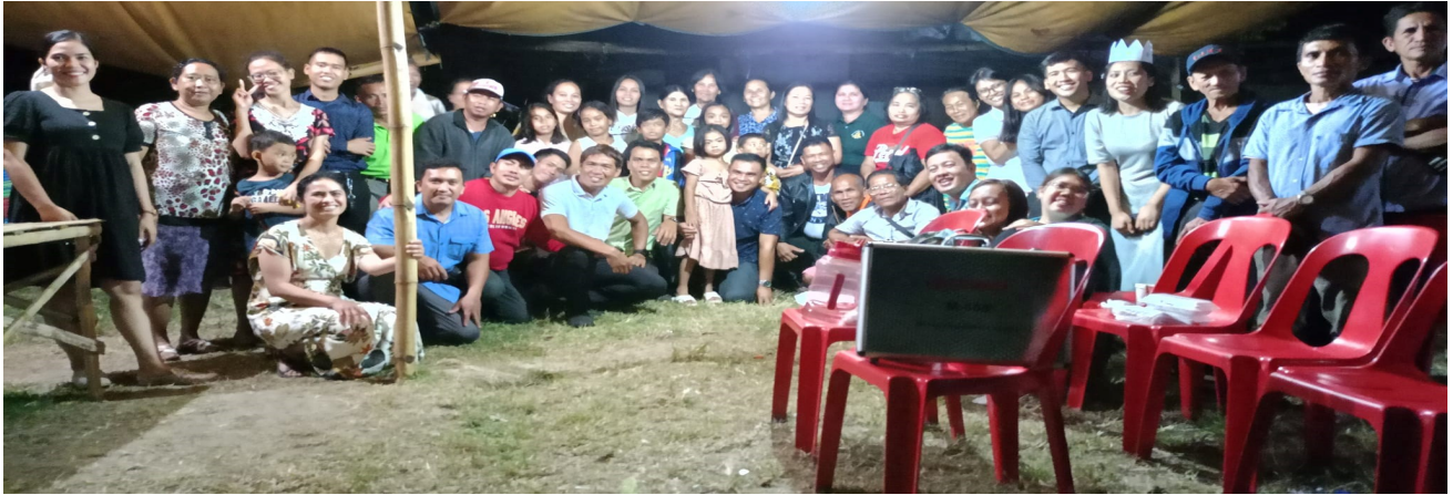
This photo was taken during the final night of the nightly crusade in Dao on January 10, 2024.

In January 8-19, 2024, two successful mission crusades were held in the sitios of Pansoy and Dao, San Andres, Quezon. These crusades were organized by the Essence of Health Ministry in partnership with LIGHT and the local churches of the South Central Luzon Conference from the Bondoc Peninsula District, aiming to spread the gospel and provide medical assistance to the community.