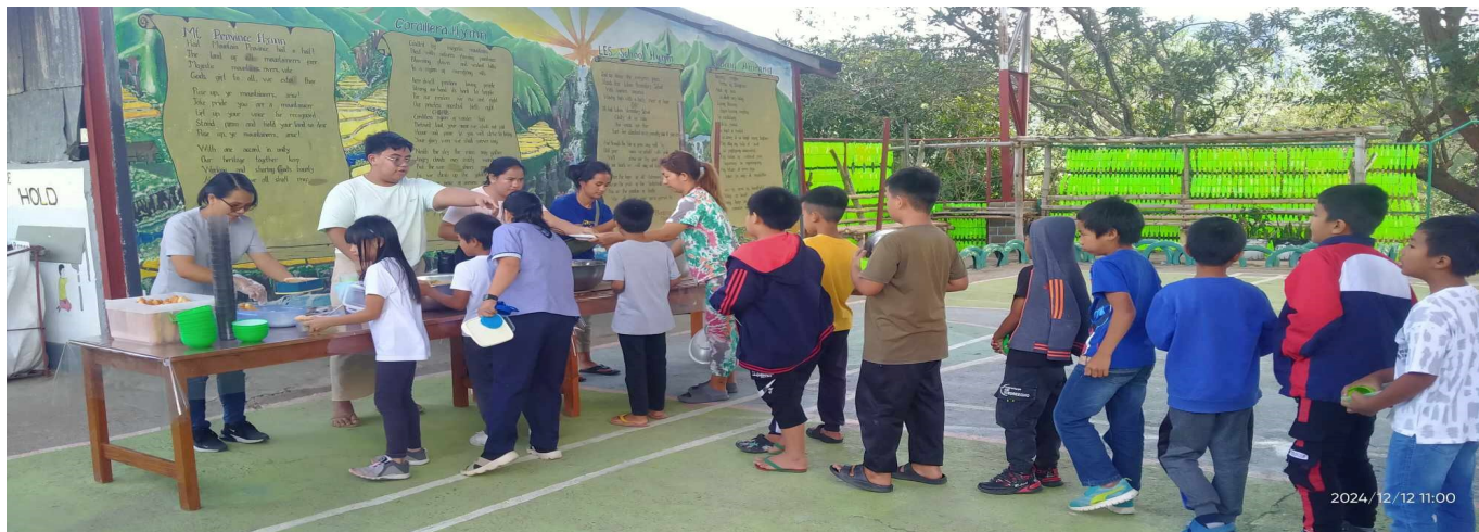
During the feeding program at New Lubon Elementary School, as the pupils waited in line to receive their food.

The Essence of Health Ministry, In partnership with the Mountain Provinces Mission, conducted a series of impactful feeding programs in Tadian, Mountain Province, as a testament to God's love for the children. These events were held at Lubon Elementary School on November 28 and December 12, 2024, and at New Lubon Elementary School on December 9, 2024. The Essence of Health Ministry allotted 30,000 pesos for these feeding programs, with a budget of ₱5,000 allocated for each feeding.