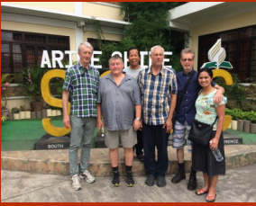
Essence of Health Ministry team with SCLC President.

"I am with you always even unto the end of the world. Amen."