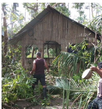
Bamboo Church after typhoon.

because His truth is to be found there. We glorify God because of His goodness and protection in re-